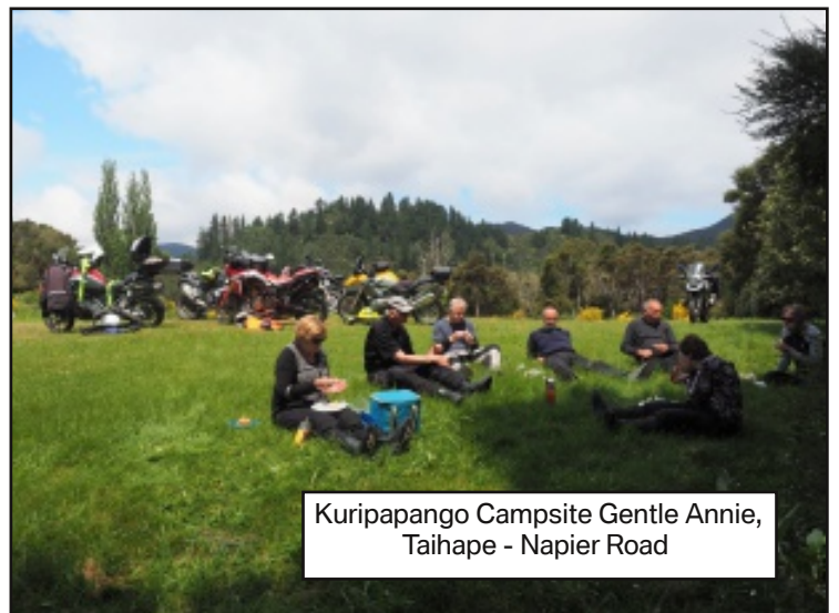
Kuripapango Campsite Gentle Annie, Taihape - Napier Road

In general news there's an ongoing problem around the emergence of an online based riding community named in such a way that folk searching for a genuine (authorised) BMW motorcycle home are misled. The community itself probably has a legitimate place and meets a certain need in the riding world but the deliberate choice of name (BMW Riders New Zealand) is misleading. The community is a multi-brand/all comers' type deal; very few BMW bikes are present on their rides. Reputational damage for us is already a reality as even our existing partners in the riding world are being misled, incorrectly judging us according to the conduct of this group leading rise to unnecessary explanation and/or damage control. BMW and BMW Clubs International probably won't tolerate this unauthorised use of the BMW brand for much longer but action by individuals to encourage a name change either in person or via social media should take place wherever possible. There is only one motorcycle club in New Zealand authorised to use the BMW brand and we are it.