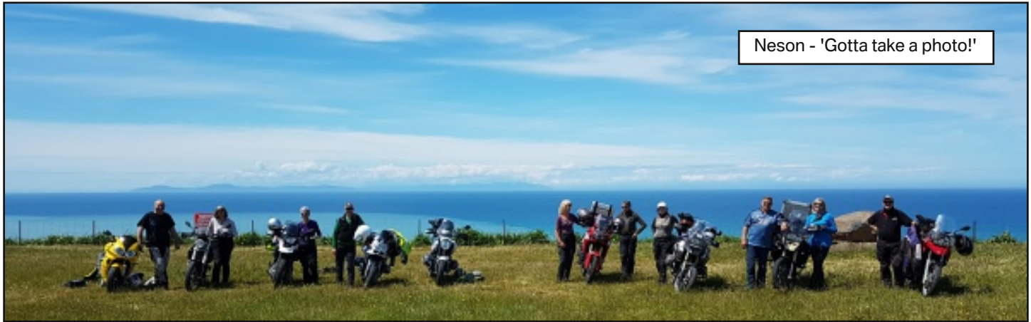
Neson - 'Gotta take a photo!'