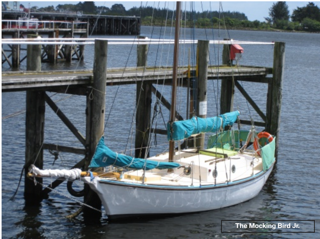
The Mocking Bird Jr.