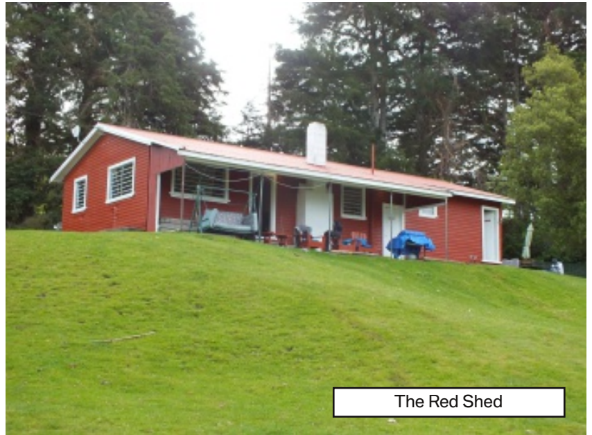
The Red Shed

On Friday morning we all had an early breakfast we departed down to SH2 North East passing under the Mohaka Viaduct.