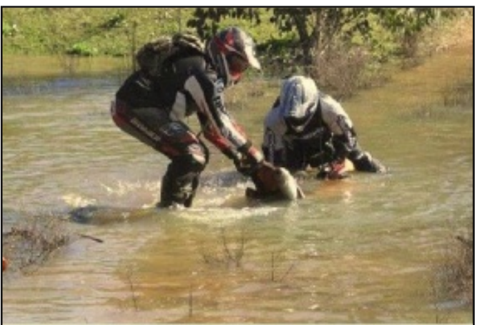
WHEN OFF-ROAD RIDERS Lose their Keys!