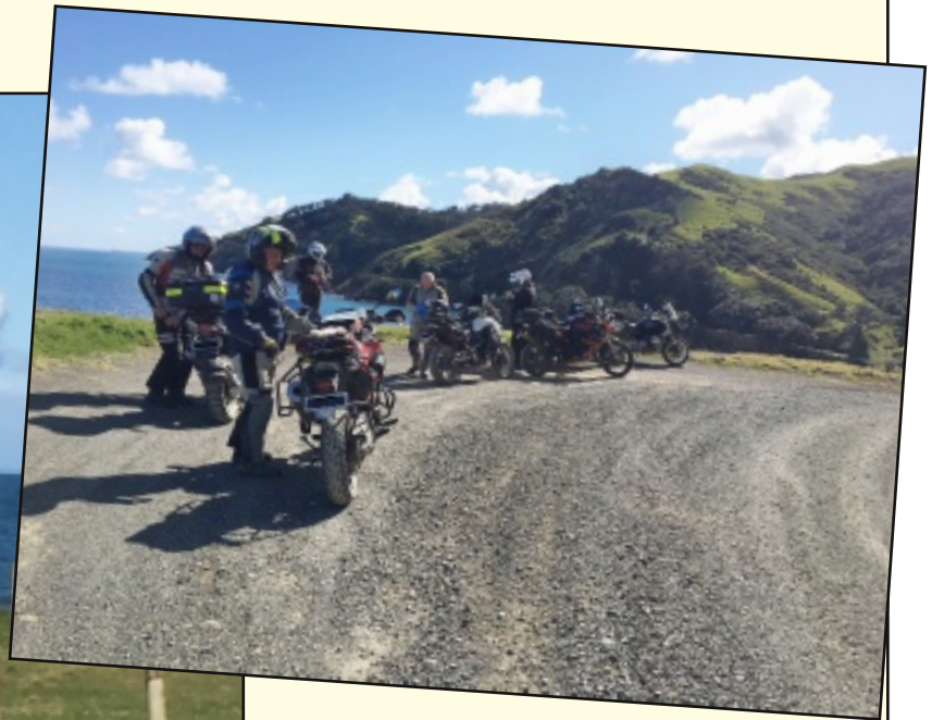
Above: On the way to Fletcher-Bay.

The Coromandel Fletcher Bay gravel ride.