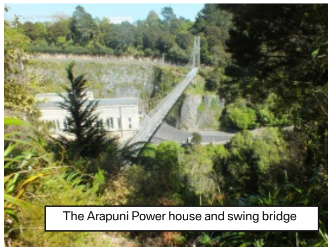
The Arapuni Power house and swing bridge

Highlight's of Day 3, the visit to the Swing Bridge at Arapuni, the gravel roads into Aria, and the Aria Cossie Club.