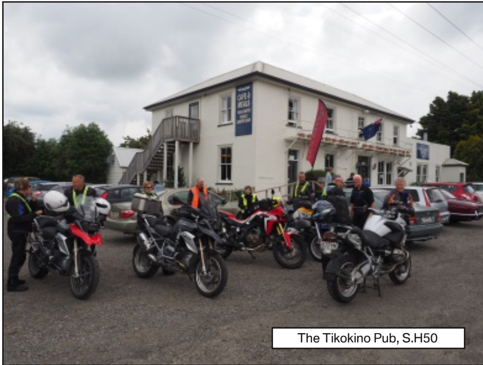
The Tikokino Pub, S.H50

Remember to get your Rally 2019 registrations in real soon, we can deal with some very last minute registrations but we are getting close to the date already.