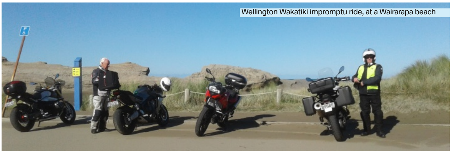
Wellington Wakatiki impromptu ride, at a Wairarapa beach

We found a bench in the sunshine and enjoyed lunch whilst reflecting on our wonderful ride. One thing both Dale and I found was that our antifog pinlocks were causing glare and restricting our vision with the low sun angle. Kevin.