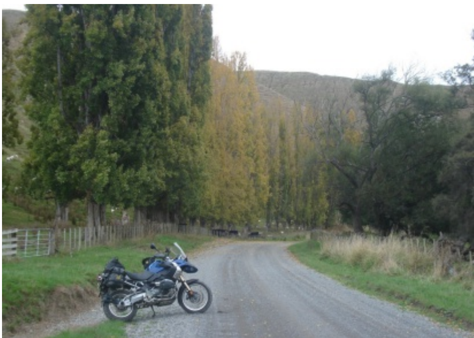
Below: Turakina Valley starting to show autumn colours as Stephen headed home.