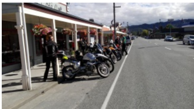
Nelson