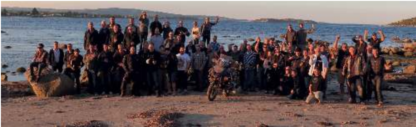
Text and photos: BMW Motorrad