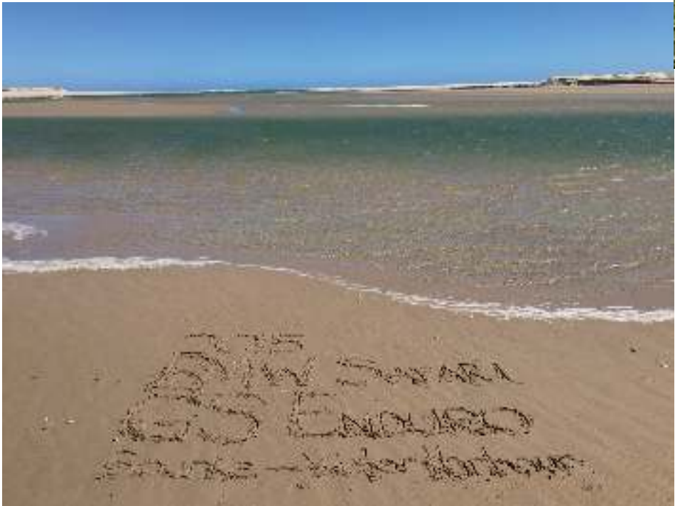
Top to bottom: The aptly named Enduro Road intersection. Rolling Adelaide Hills. Journey's End, the mouth of the Murray. Victor Harbour, before the Aftermatch Dinner.