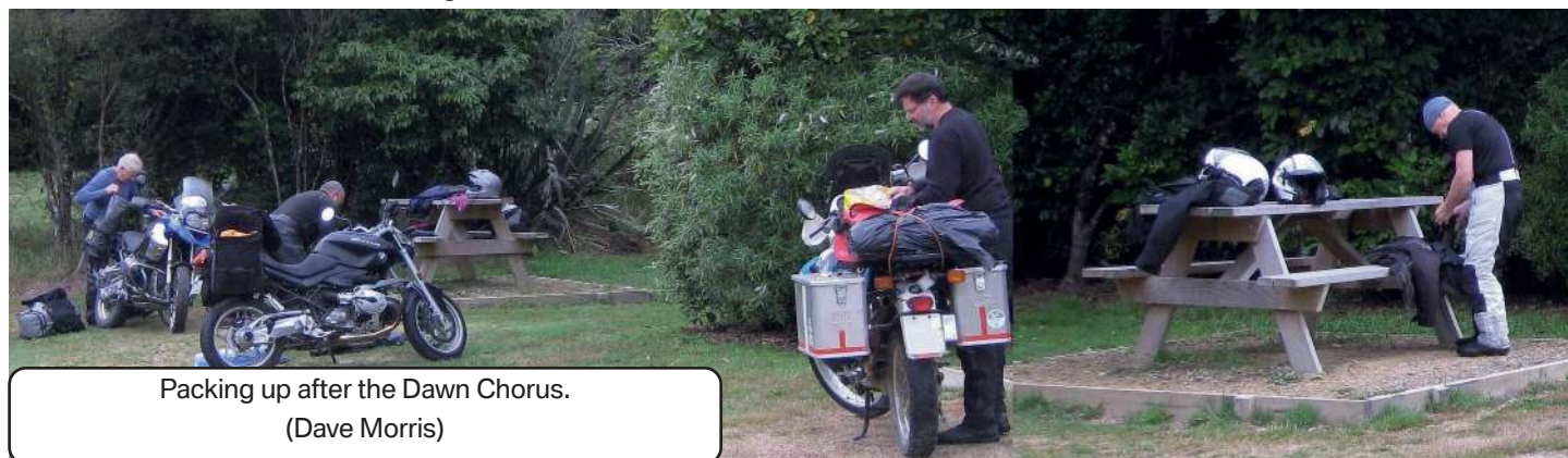
Packing up after the Dawn Chorus.