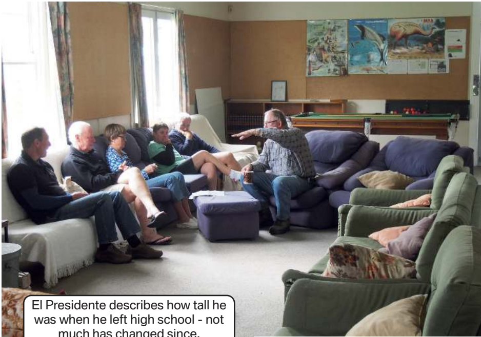
El Presidente describes how tall he was when he left high school - not much has changed since.