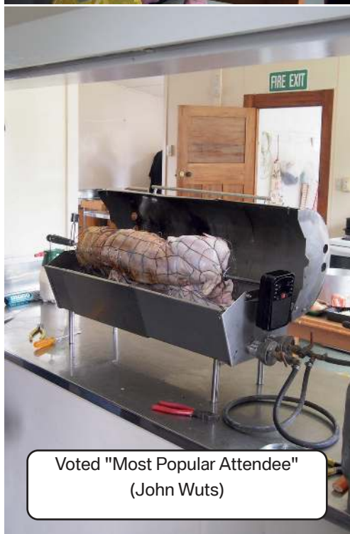
Voted "Most Popular Attendee" (John Wuts)

Strangely , very little text about the actual RAG - what goes on leave, stays on leave, obviously.