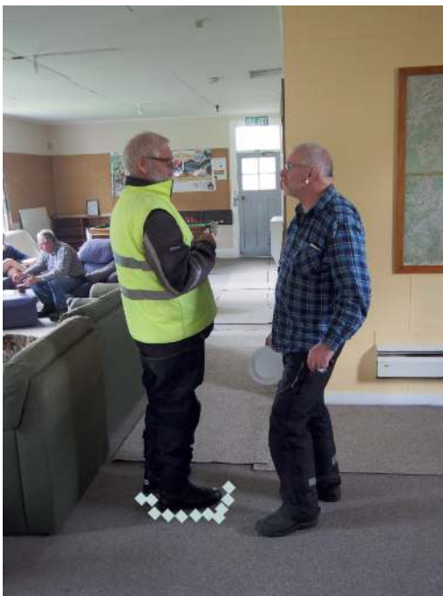
Too much "Gracelands" album? Diamonds on the soles of his shoes? Nope, new dancing shoes, P10.