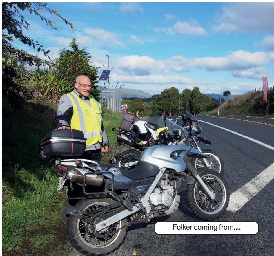
Folker coming from....

Editor: And it's farewell from him, and it's farewell from him, too.