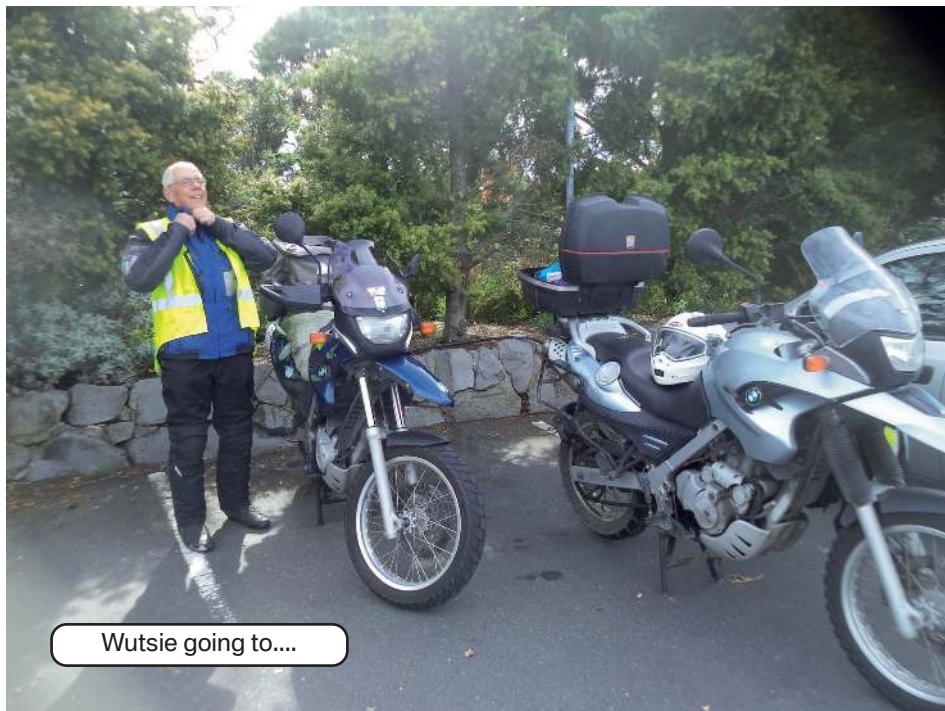
Wutsie going to....