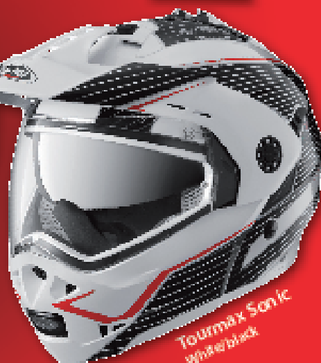
Tourmax Sonic White/black

View the full helmet range on www.motorgear.co.nz