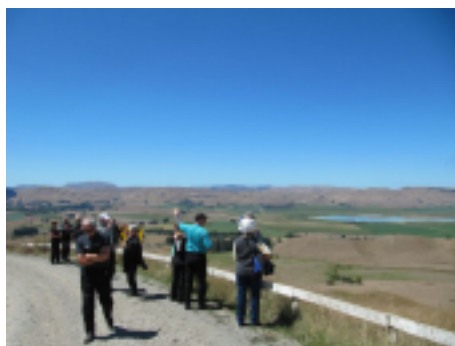
View from Burma Road.

It was great catching up with members from a neighbouring area and we hope to do it again. Our thanks go to Dan for scoping and leading this very successful ride.