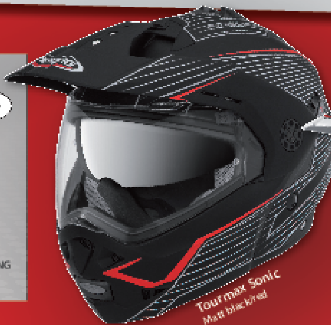
Tourmax Sonic Matt black/red