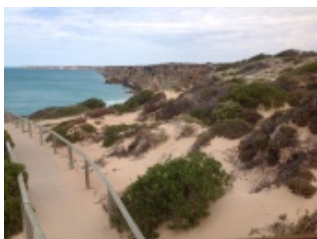
Head of the Bight

Rode across the Treeless Plain, nothing over 50cm high for 100km, just endless horizon. Also rode down to Head of the Bight, great views but the Whales couldn't wait & had left 3 weeks ago.