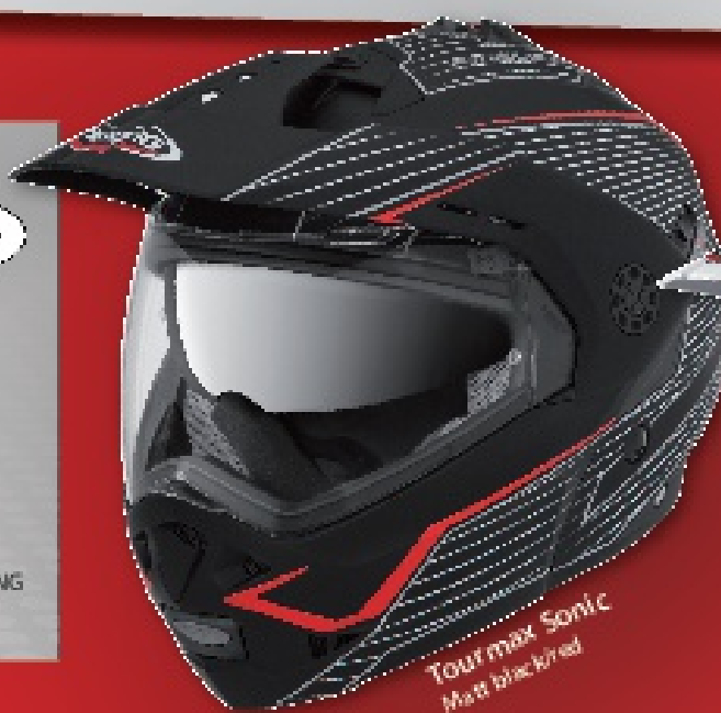
Tourmax Sonic Matt black/red