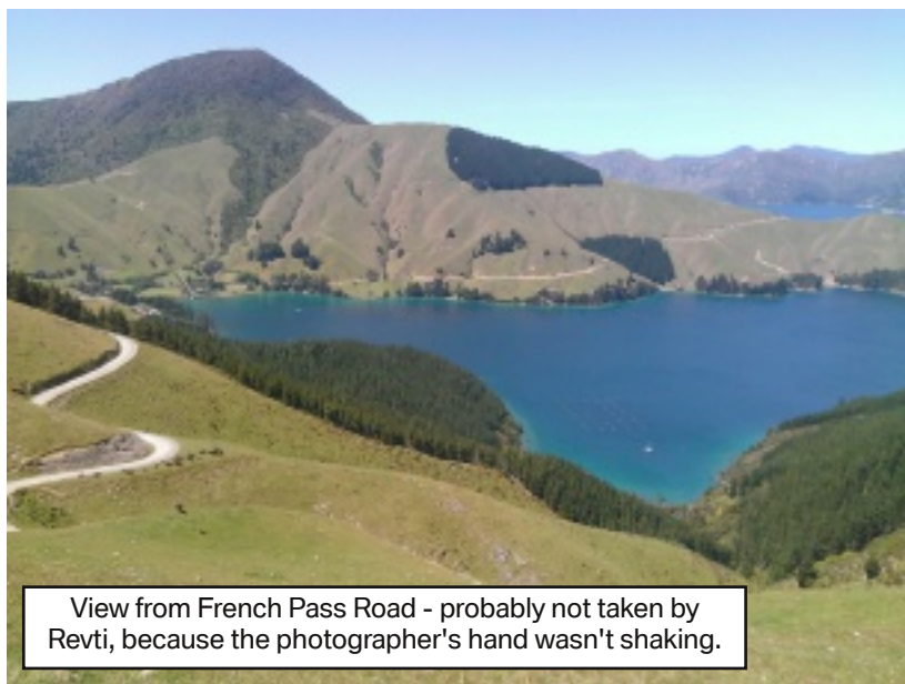
View from French Pass Road - probably not taken by Revti, because the photographer's hand wasn't shaking.

This day was a total contrast from the previous month's ride. We turned up on