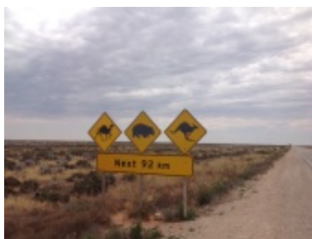
Game changer - swapped out the Emu for a Wombat, let's play!

No Kangaroos till later but lots of dead snakes & dead Wombats, like 10 in a 300m stretch. These are butt little creatures and can apparently rip the sump out of a car when it hits them, be like hitting a rock on the bike. I mentioned the number to the lady at Ceduna information centre and she said they'd done a survey and stopped counting Wombats at 2 million so apparently a few road kill's no big deal.