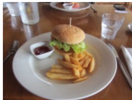
Chicken Burger and Chips at Hansens