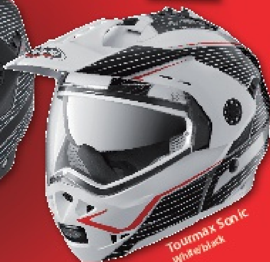
Tourmax Sonic White/black

View the full helmet range on www.motorgear.co.nz