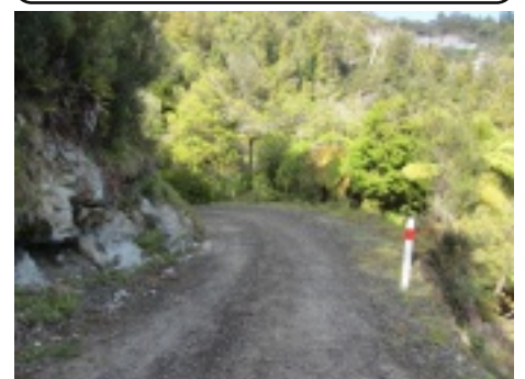
Below: Approaching Kiwi Road summit.