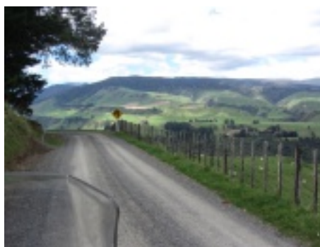
Rider's (Oaters) view from Makoura Road - great flowing gravel - bliss for a GS rider!