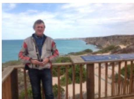
Japanese Tourist taking photo of me - now that's a first!

Also met a lady from Kuwait / Perth riding a Triumph Sprint 675 triple at the Nundroo Roadhouse heading back to Perth from Adelaide at speed by the sounds of it. She was doing this trip 4 times in 12 months. The heat would be unbelievable in Summer. Bike was well set up & had the seat lowered as she is barely 5' tall.