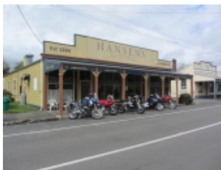
Machines parked outside Hansens Cafe Kimbolton