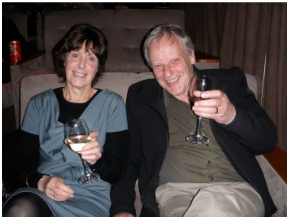
Granma looks OK, but Granpa, "Looksh like he'sh been shellabrating."

It was still raining as we made our way to Brown Owl ( suburb north of Upper Hutt