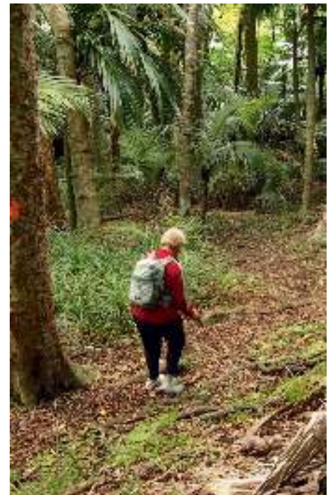
Pam Wuts strides out to look for her missing garden gnome.