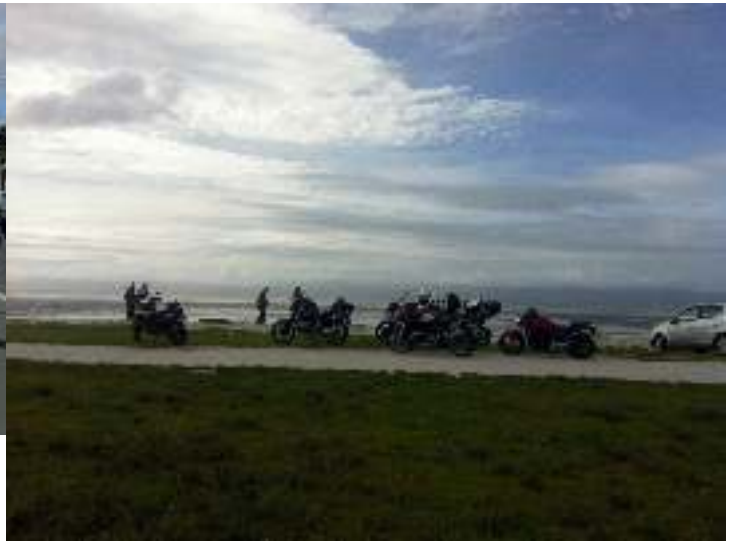
Kaiaua, Seabird Coast. Guess the birds rode in on their motorsickles.