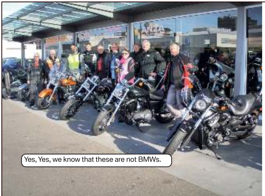
Yes, Yes, we know that these are not BMWs.