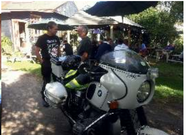
Funky Lizard at Paengaroa - way good lunch stop.