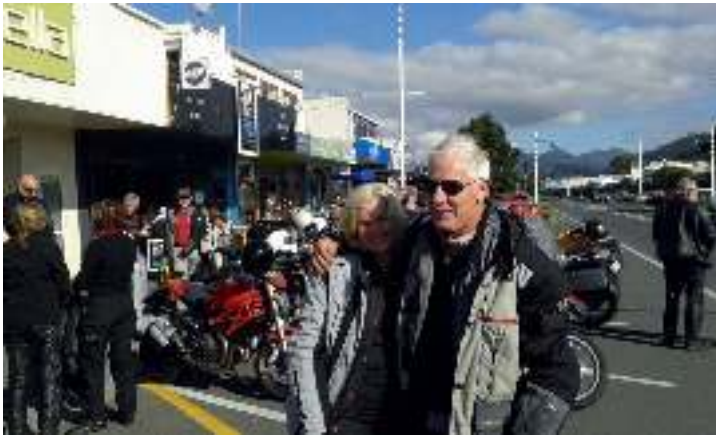
Bay of Plenty Area Reps. GET A ROOM, YOU TWO!!