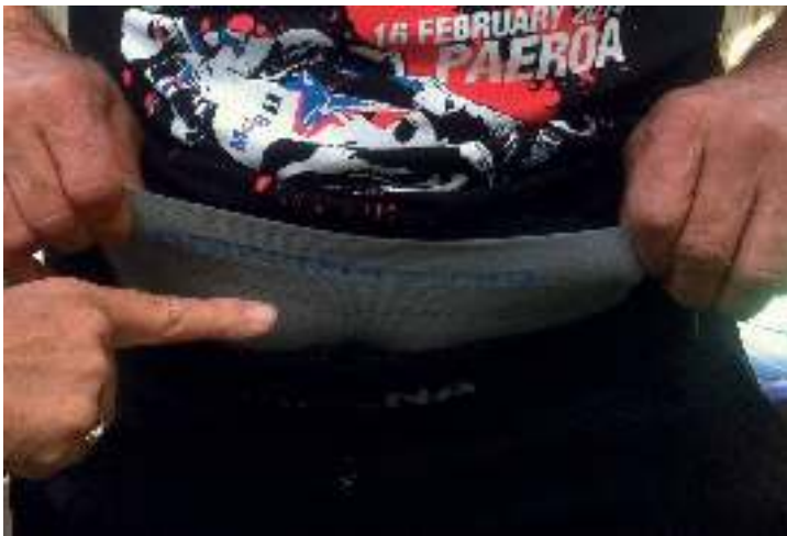
Bit hard to see, short of room: BMW "Patriot Knickers" with the BMW Motorrad logo.