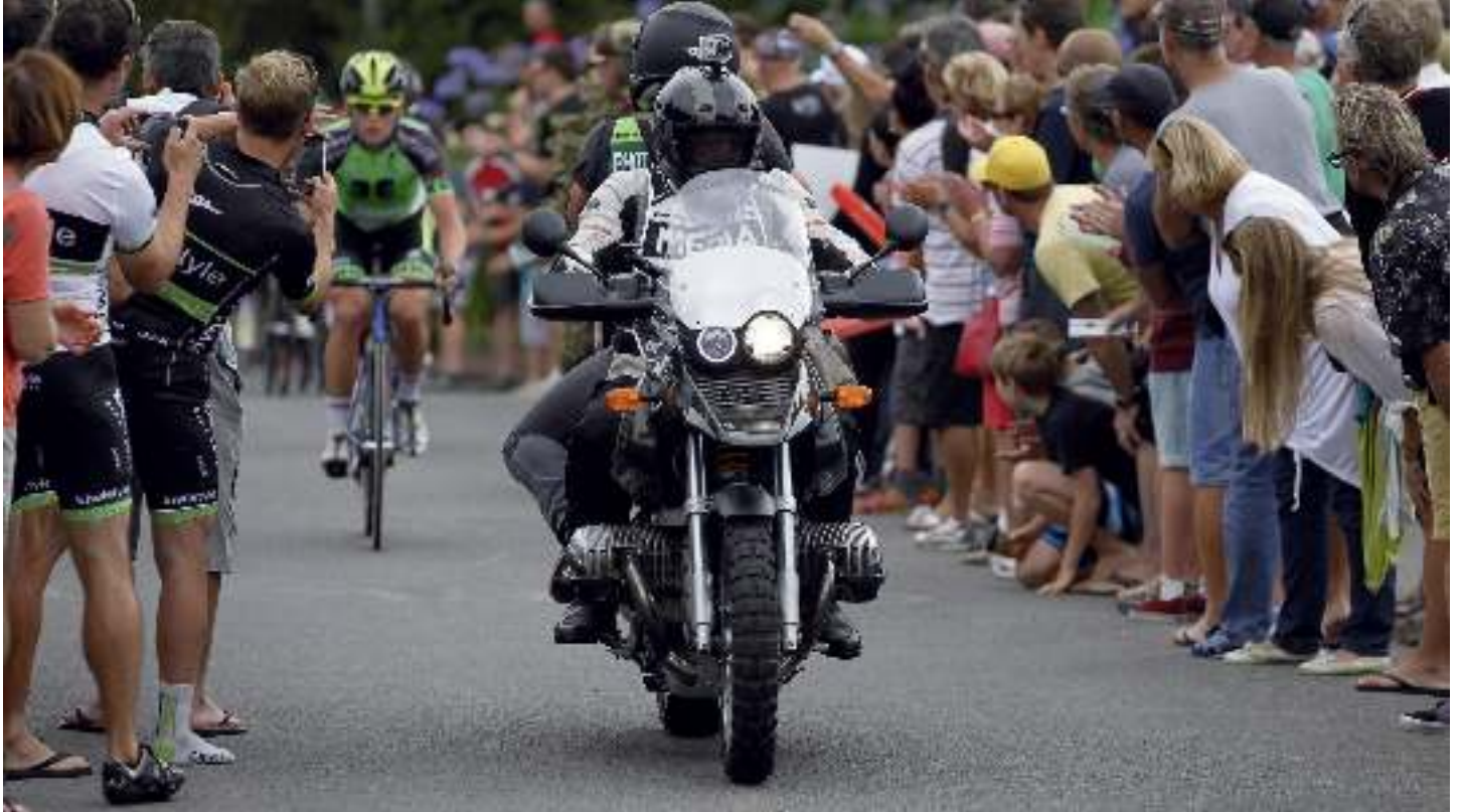
Coming and Going at the National Elite Cycling Championship