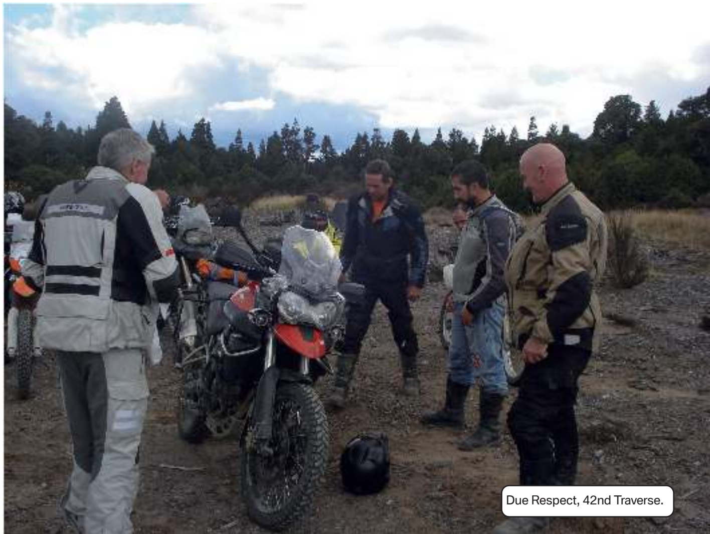
Due Respect, 42nd Traverse.