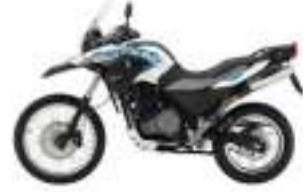
G650GS SERTAO $14,990