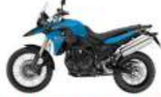
F800GS from $21,290