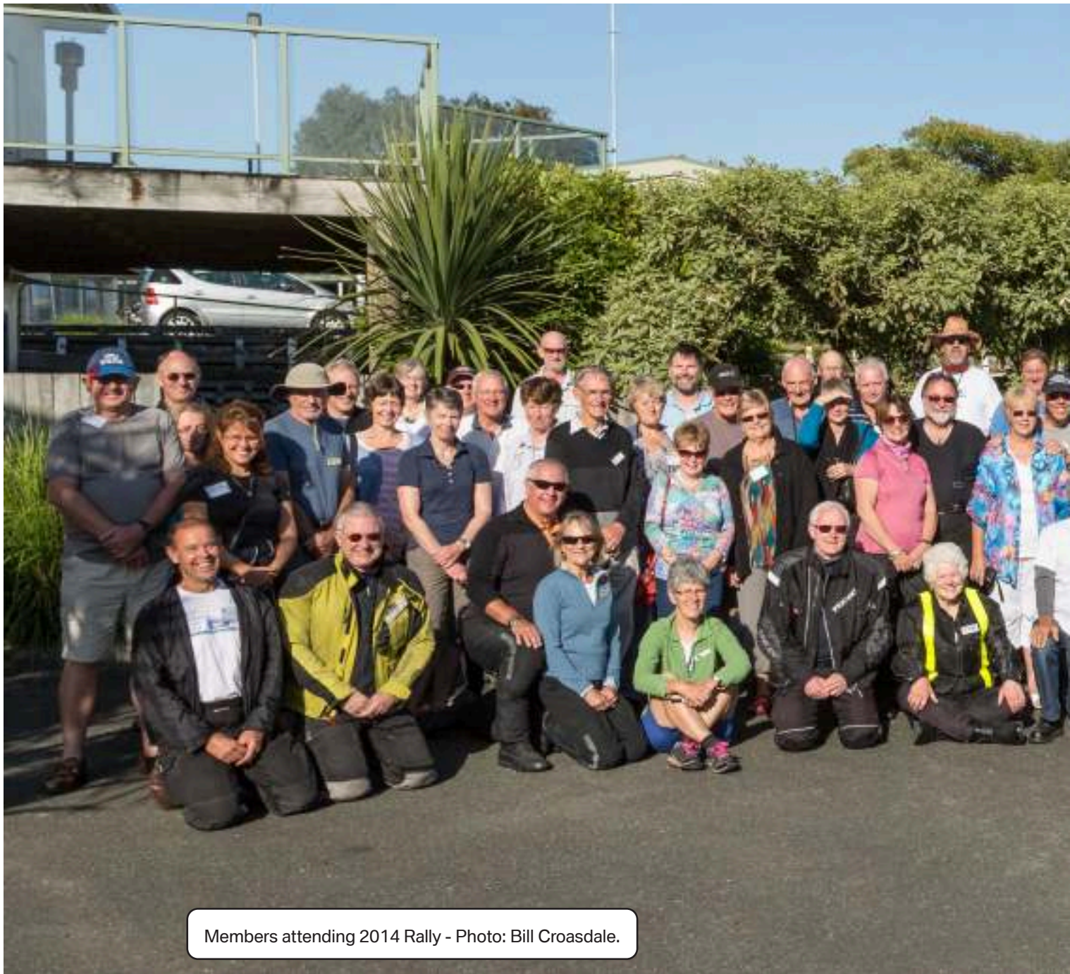
Members attending 2014 Rally