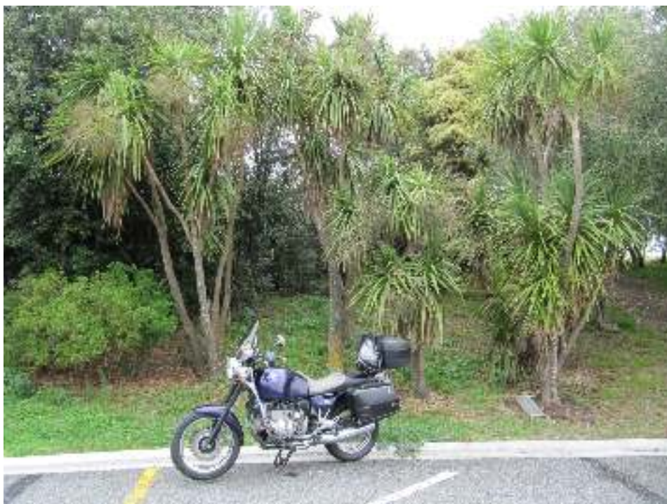
A photo of some fine examples of Cordyline Australis, spoiled by some Erk parking a motorcycle in the way. (Norman Nichol)