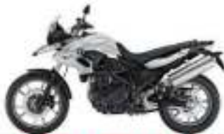
F700GS from $17,890