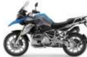
R1200GS from $27,990