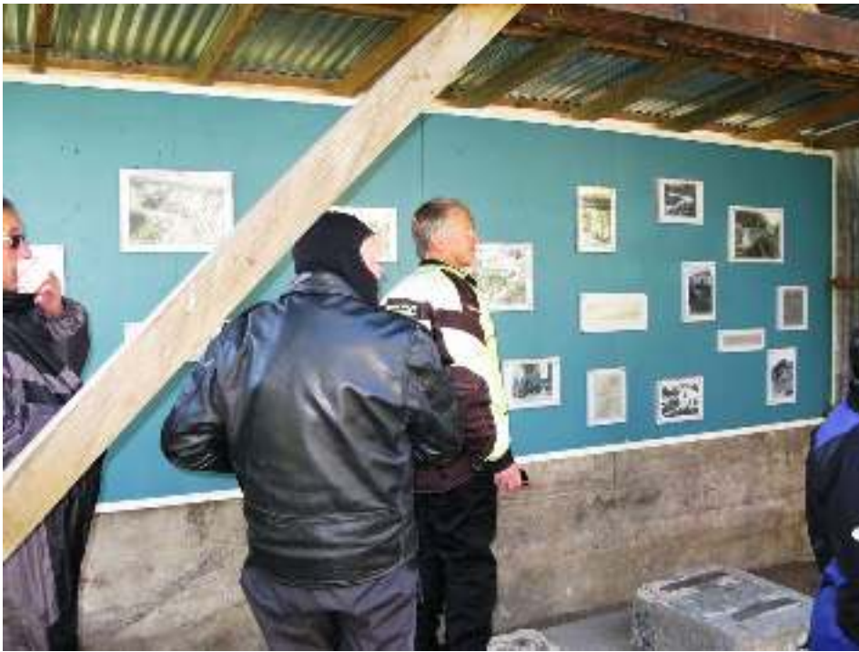
Above: Rangitikei members at the Mangaweka power station memorial Below: Hansen's Café, Kimbolton.

It was not long before the junction just north of Apiti hove into view and, for sealed road riders, we took the unusual step of turning right towards Rangawahia through the "Marton Block" area on a newly sealed road, which is to be promoted as a local tourist route. This scenic route winds its way down and up two river valleys and across braided rivers with native bush in the background while all the time the Ruahines look down on all comers.