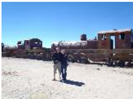
Kevin and Karon at the train graveyard

We rode further on up the Sacred Valley to have lunch in a small town. We parked up the bikes and boarded the Inca Rail train to Machu Picchu where we over-nighted, leaving at 6:00 am to bus up to the actual site. It is hard to describe this historic wonder; our guide was very knowledgeable on the history though. We bussed back down the mountain at midday and returned by train to the bikes.