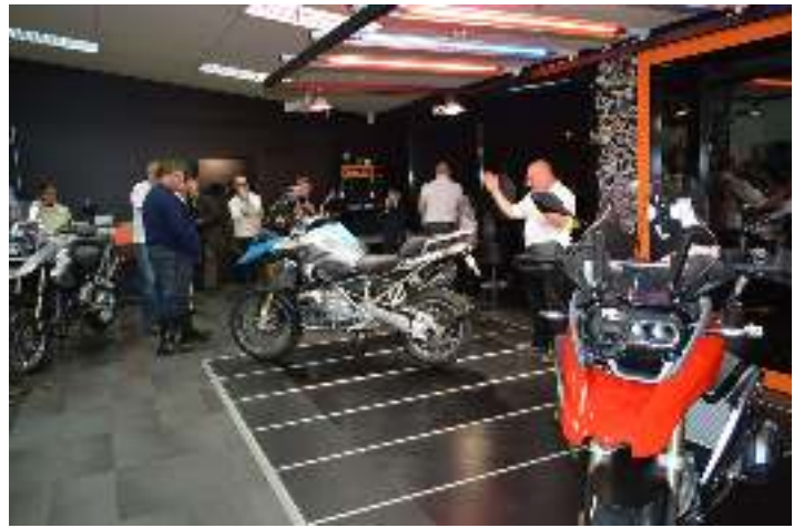
Top left: Daniel in 'welcome' mode at the Christchurch launch of the 2013 R1200GS