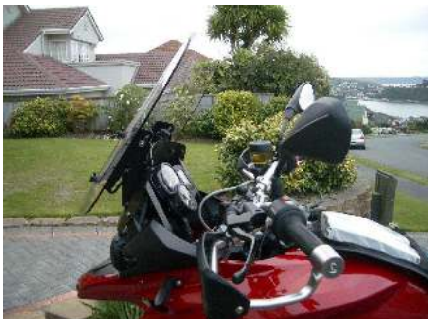
Top: Bike with original screen Middle: View of the brackets Bottom: Bike with new screen fitted