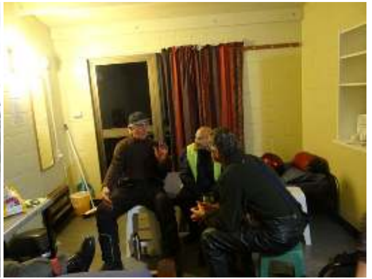
Top left: Nelson members at the beginning