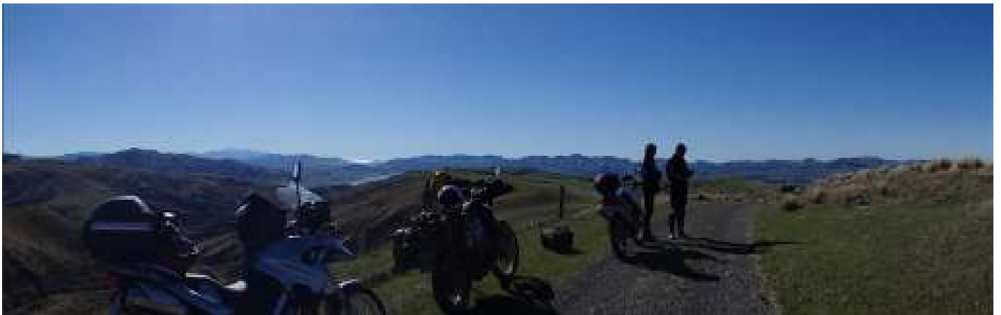
On top of the world - side trip off the Spotswood-Culverden route

valleys with sweeping fast corners, the road suddenly turns into a narrow mountain pass, meandering through the rainforest, passing the "hotspots" of Sylvia Flats and Maruia Springs before flattening out at "Springs". This was only meant as a re-grouping spot for the gravel team, but little did we expect Revti and Sue, who left Nelson on two wheels the day before, arriving on four! Their trusty boxer had decided to stay in Hanmer Springs, probably because of the nice weather and beautiful scenery.