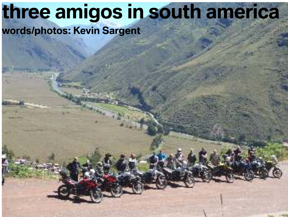
Group photo up the Sacred Valley, Peru