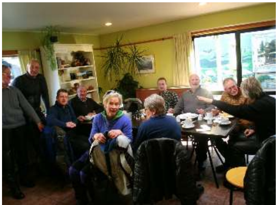
Otago/Southland members gather at the Wild Walnut Café in Lawrence