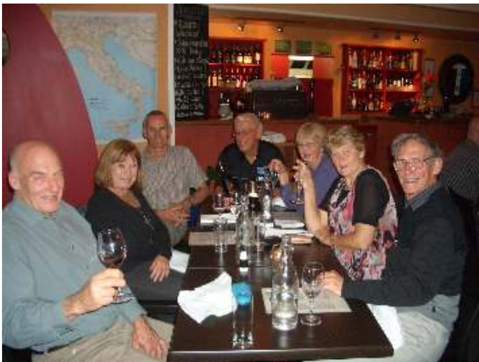
At the Molo Restaurant