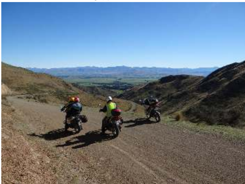
Spectacular view of the Southern Alps as Matthias, Silke and Tony descend Lowry Peaks Range (Spotswood-Culverden)

What we encountered took us by surprise, to put it mildly. After we'd parked up and walked just 10 metres, we came across a dozen or so baby seals in this tiny pool, ducking and diving and