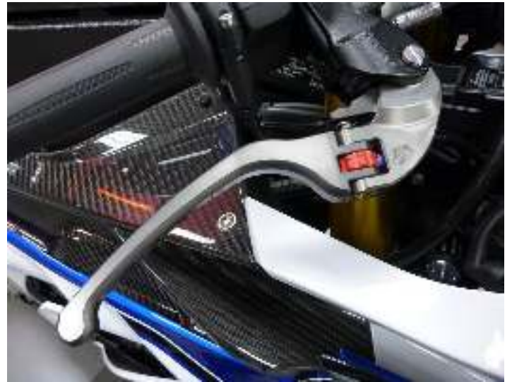
Left: Ooh aah! Lost for words!