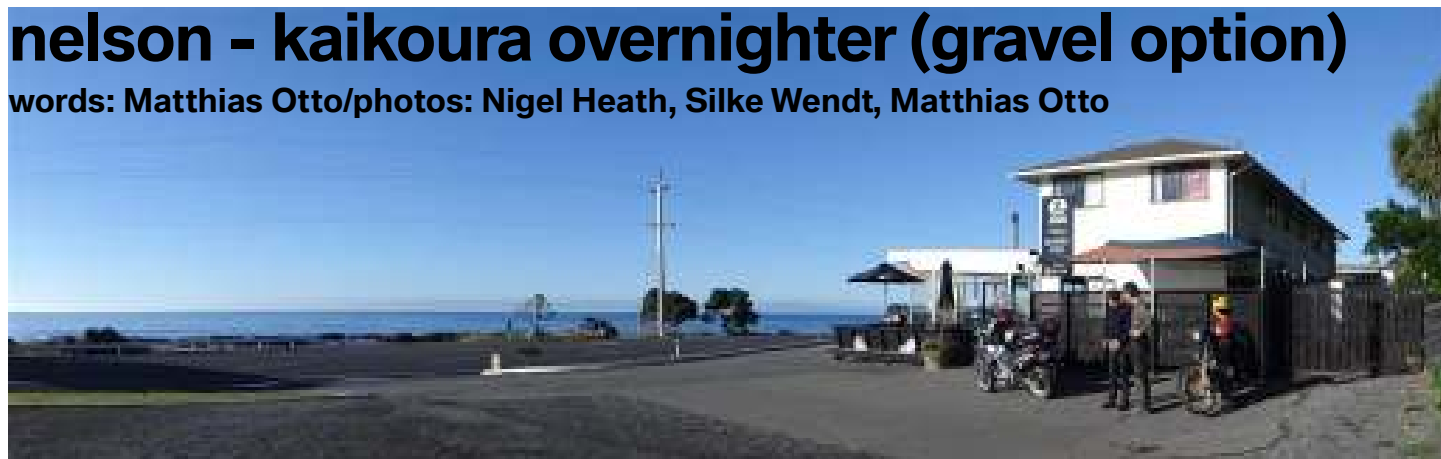
Sunny breakfast stop south of Kaikoura