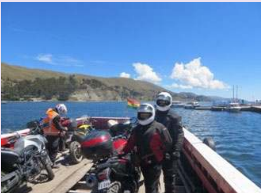
On the barge at Lake Titicaca