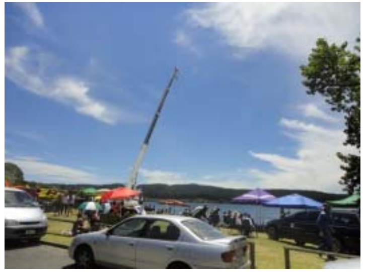
The crane putting speed boats on the lake

screaming motors from the water. The big crane lifting boats into the water was a clue - Speed Boat Race Championships!