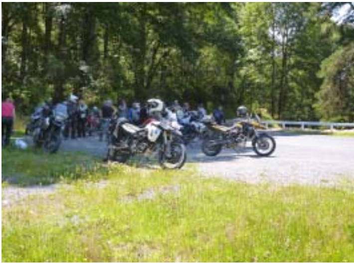
Shade break at Ongarue

fallen across the railway line. Caught between the rails in the mountain of mud and rocks was a large boulder about 1.25 metres in diameter. The engine was able to push the boulder for a short distance, but then the weight of it threw the engine, tender and postal van off the track with 17 people losing their lives and 28 suffering serious injury.