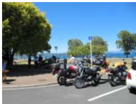
BOP members arrive at Taupo