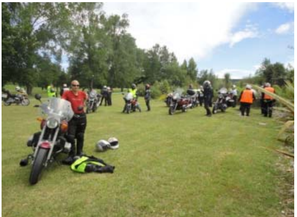
Lunch stop at Mangakino