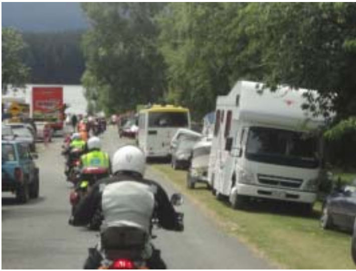
Riding into the Mangakino Reserve