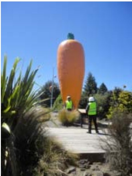
Measuring up at Ohakune