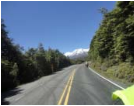
A stunning day in National Park